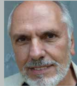
Robin MICHAEL CRISTOFER