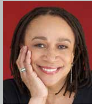
Liz S. EPATHA MERKERSON