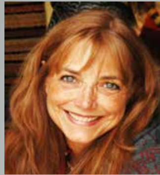
Joan KAREN ALLEN

Featuring a GOLDEN GLOBE® , EMMY® , TONY® , and PULITZER PRIZE -winning cast: