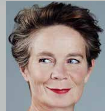
Erikson CELIA IMRIE